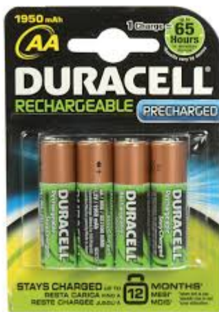
AA Alkaline Battery (any brand name)